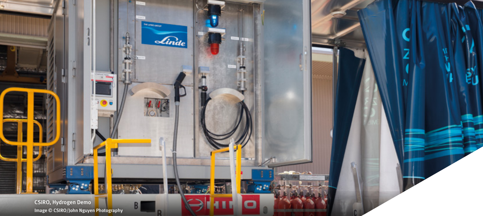
CSIRO, Hydrogen Demo Image