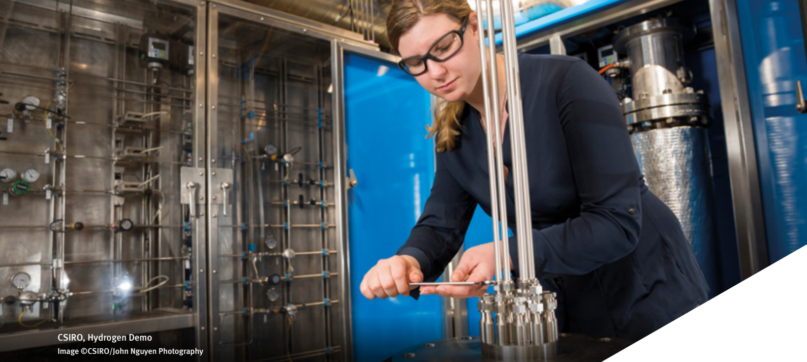
CSIRO, Hydrogen Demo Image