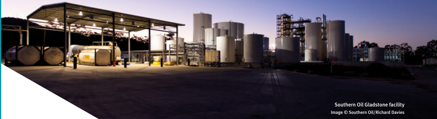
Southern Oil Gladstone facility