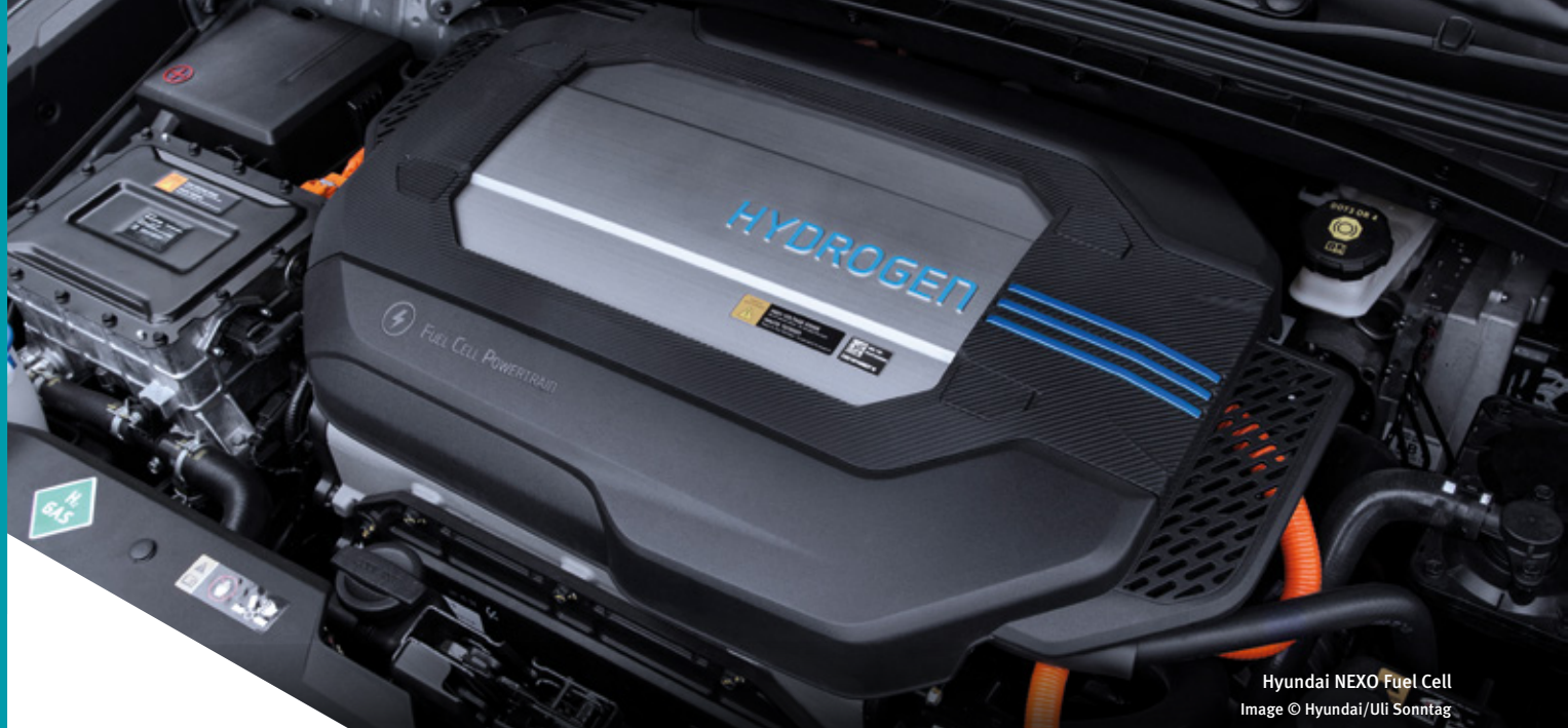
Hyundai NEXO Fuel Cell

In Australia, CSIRO has recently released the National Hydrogen Roadmap . The objective of the roadmap is to provide a blueprint for the development of an Australian hydrogen industry. It is designed to inform the investment decisions of stakeholder groups that will enable the industry to continue its growth in a sustainable and coordinated manner. The National Hydrogen Roadmap has identified a number of potential uses for hydrogen, including: hydrogen-fuelled transport, remote area power systems, industrial feedstocks, export, electricity grid firming, heat, and synthetic fuels.