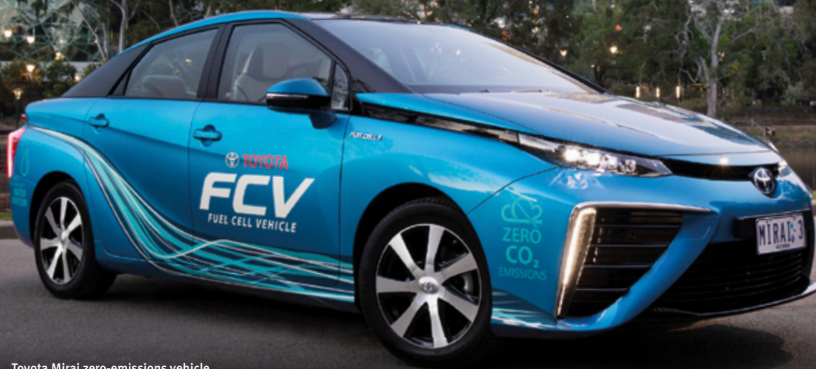
Toyota Mirai zero-emissions vehicle